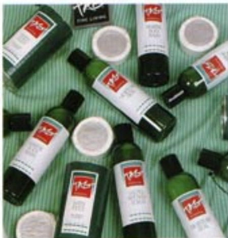
TAG ESSENTIALS, with select essential oils

Did you know? When The Broadmoor opened in 1918, there was a Turkish bath located behind the Front Desk. This was the hotel's first spa.