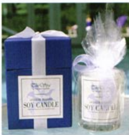
LAVENDER MEADOWS Signature Candle