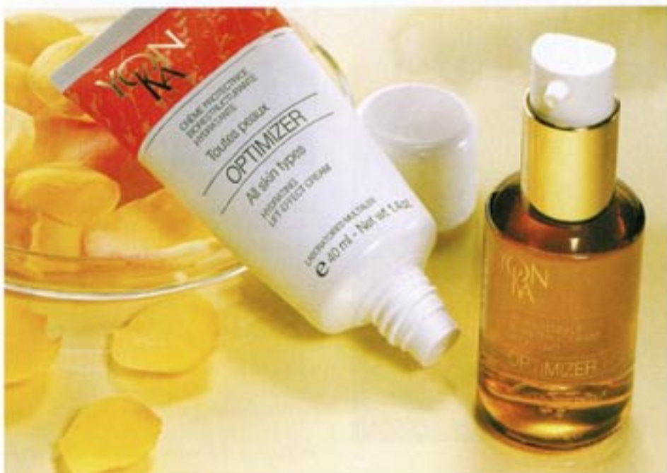
YON-KA PARIS Face, Body and Sun Products

All products and treatments available at The Spa at The Broadmoor and The Spa Shop. For more information, call The Spa at ext. 5770.