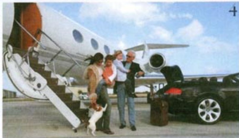
OPPOSITE PAGE: The Instant Gourmet Kitchen, an 80-piece collection designed by Certified Master Chefs of The Culinary Institute of America. (TOP LEFT) 1: the Residences at The Ritz-Carlton Grand Cayman; 2: Dylan's Candy Bar, the premier specialty candy purveyor on Manhattan's Upper East Side; 3: the SilverTAG Shower is the invention of celebrated spa designer TAG Galvan, the "king of hydrotherapy"; 4: Blue Star Jets' SkyCard offers an inventory of jets, worldwide.

and a computer-controlled touch screen programmed to vary temperature, pressure and time with unprecedented speed and precision. Shower sequences such as Think, Tonic, Spa, Rain, Anti-Stress and Never-Ending ensure you'll never think of your morning ritual in the same way again. At $100,000 per custom installation, this commercial-caliber shower may be the best investment you'll ever make. For details, go to www.tagsignature.com .